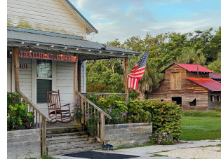
City of St. Cloud 3rd Runner-Up