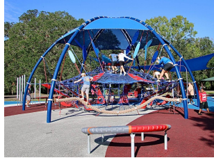
Alachua County 2nd Runner-Up