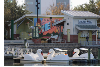
City of Oviedo 3rd Runner-Up