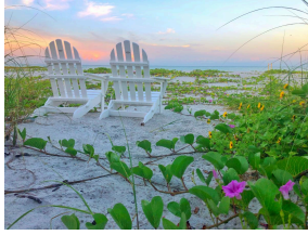
Town of Longboat Key 1st Runner-Up